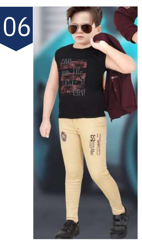
Basic Polo shirt Fabric : cotton Type : customized

Baisc Polo shirt (Embroideries) Fabric : cotton