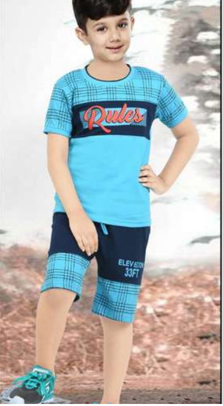
Basic Children's apparel Fabric : Ramie Rounded neck