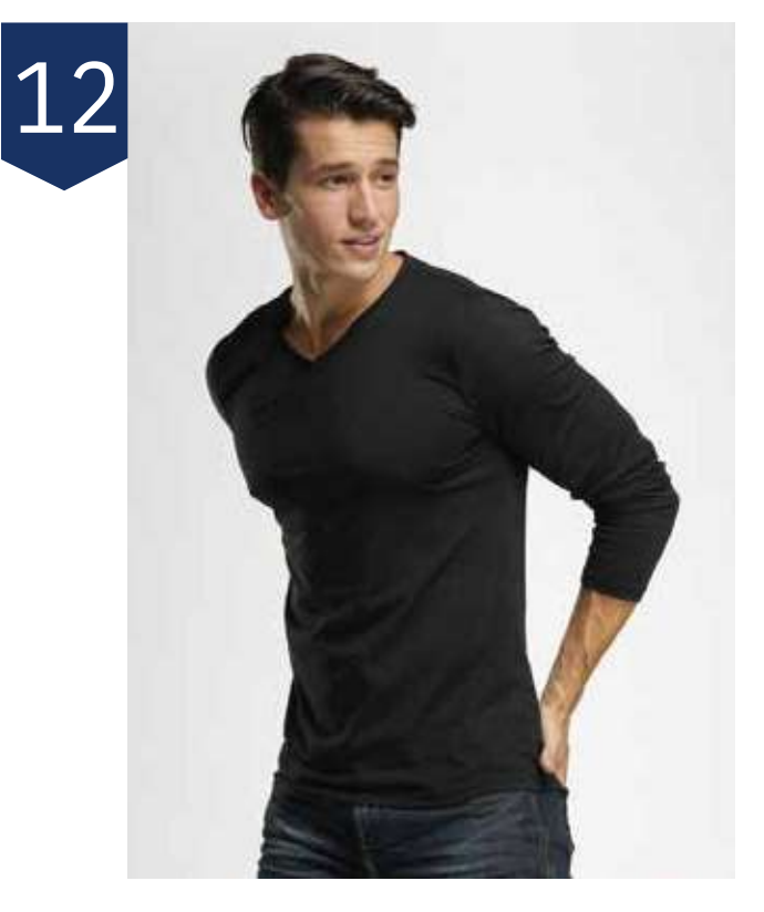
Basic Long sleeve T-shirt Fabric : cotton V-neck