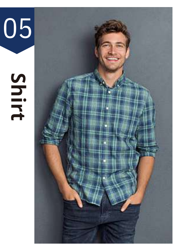
Basic Shirt Fabric : colored cotton