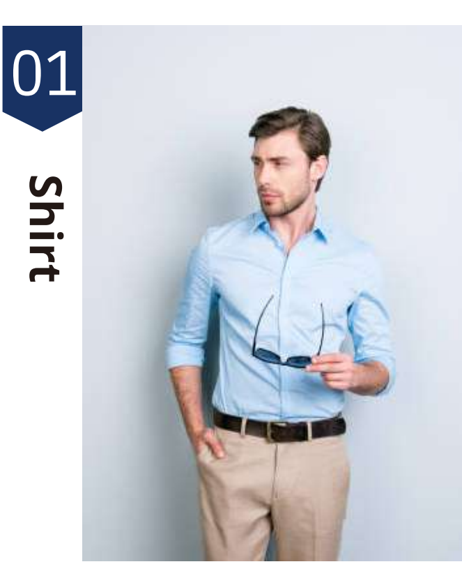
Basic Shirt Fabric : colored cotton