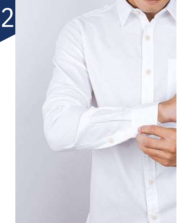
Basic Shirt Fabric : Ramie