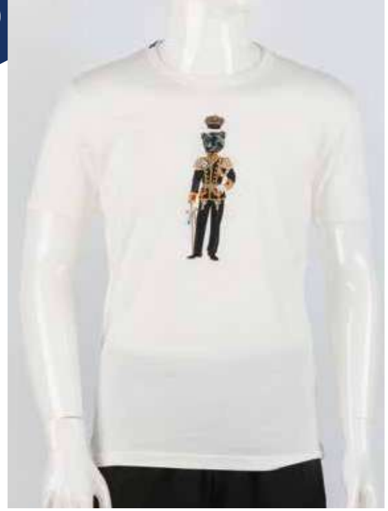
Embroideries T-shirt Fabric : cotton Rounded neck