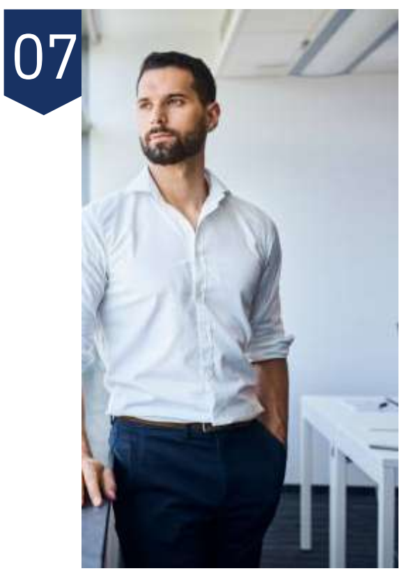
Basic Shirt Fabric : Polyester