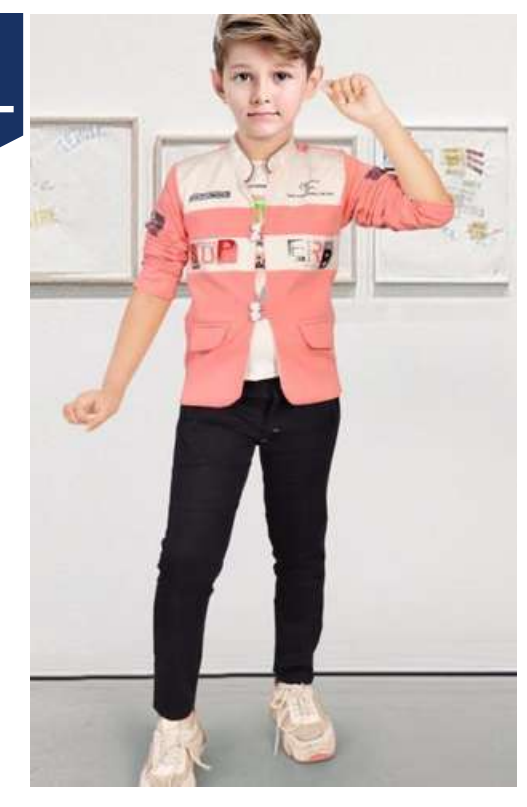
Basic Children;s apparel Fabric : colored cotton