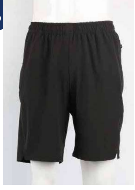
Basic Casual-pants Fabric : cotton