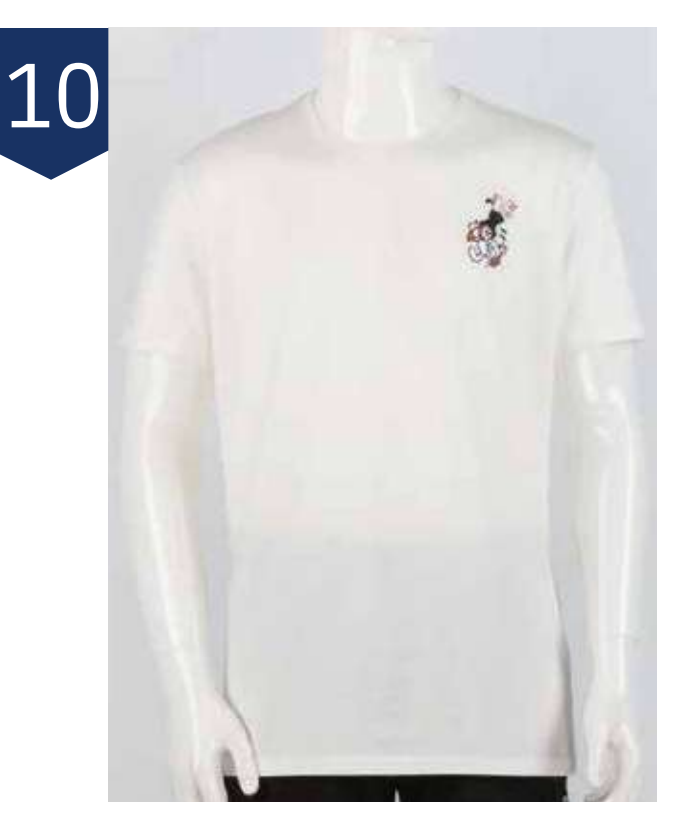
Embroideries T-shirt Fabric : cotton Rounded neck