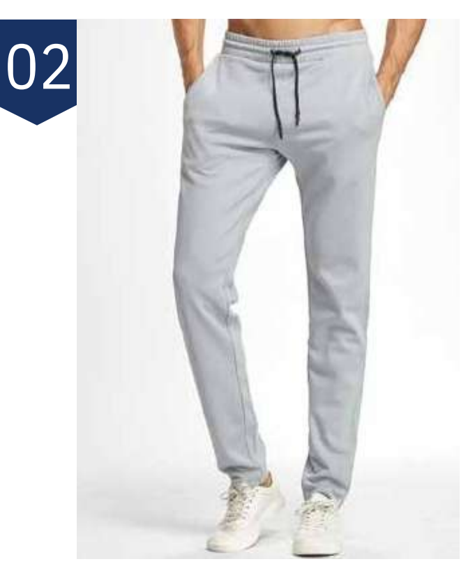
Basic Casual-pants Fabric : cotton

Ribbed Cuff Casual-pants Fabric : cotton