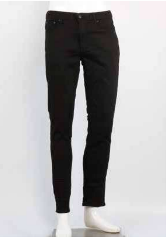
Ribbed Cuff Casual-pants Fabric : cotton