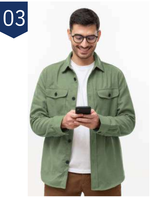
Basic Shirt Fabric : Chambray