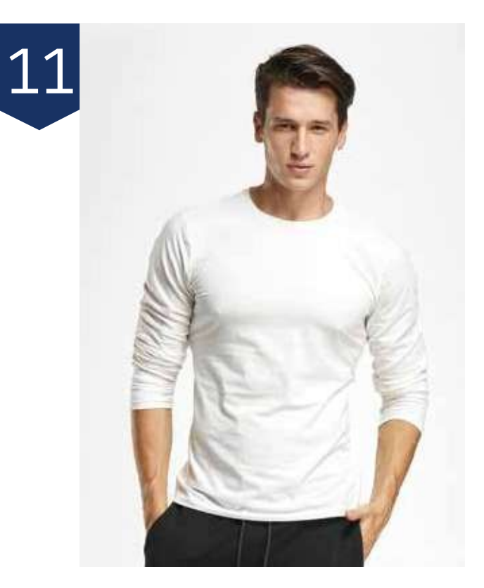
Basic Long sleeve T-shirt Fabric : cotton Rounded neck