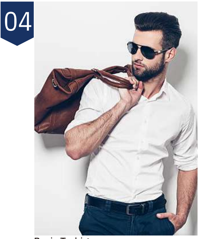
Basic T-shirt Fabric : Flannel